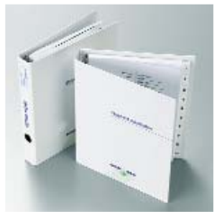
Qualification packs ensure professional installation and routine operation

METTLER TOLEDO qualification solutions for titrators take away the guess work when it comes down to ensuring quality and regulatory compliance. These professional solutions offer a myriad of benefits: