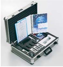
CertiCase containing certified micrometer, glass burette, resistors and voltage simulator

While the reliability of METTLER TOLEDO titrators is ensured through periodic maintenance, its accuracy relies on calibrations, which are performed by manufacturer trained and certified technicians. METTLER TOLEDO recommends yearly calibration intervals with the following benefits: